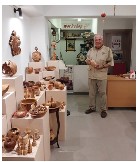
Inside the author's gallery in the tourist town of Rethymno, Crete.

In 1986, I converted my old family home in Rethymno into a woodturning gallery and workshop. Rethymno is a popular tourist location on the northern coast of Crete, and my gallery is positioned very